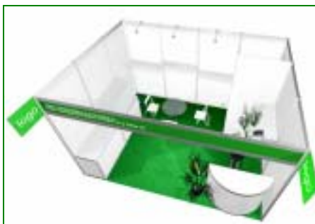
Luxury Standard Package