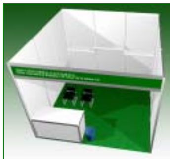
Basic Standard Package