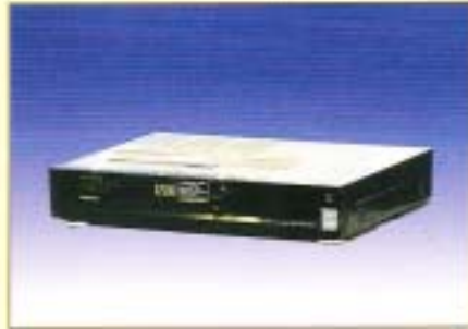
录相机 Video Recorder