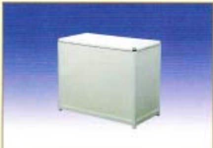
展台 1M × 0.5M × 0.79M Exhibit Table 1M × 0.5M × 0.79M