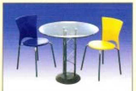
洽谈桌 0.8M × 0.74M 椅子 Meeting Table 0.8M × 0.74M Chair