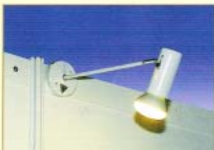
长臂射灯 60W Long Arm Light 60W