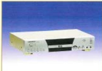
DVD机 DVD Machine