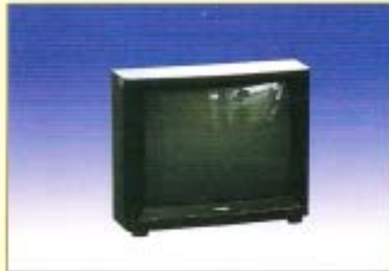
电视机 29寸 TV 29 inch