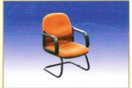
沙发椅 Sofa Chair