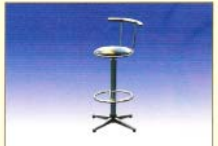
吧椅 Bar Chair