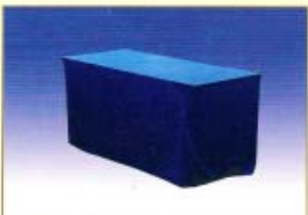
多功能桌 1.4M × 0.6M × 0.75M Multi-Functional Table 1.4M × 0.6M × 0.75M