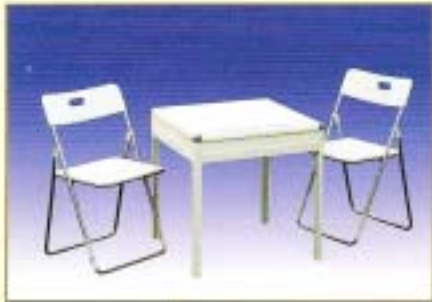
洽谈桌 0.65M × 0.65M × 0.7M 椅子 Meeting Table 0.65M × 0.65M × 0.7M Chair