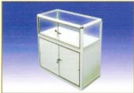
玻璃展柜 1.02M × 0.52M × 1M Glass Exhibit Cabinet 1.02M × 0.52M × 1M